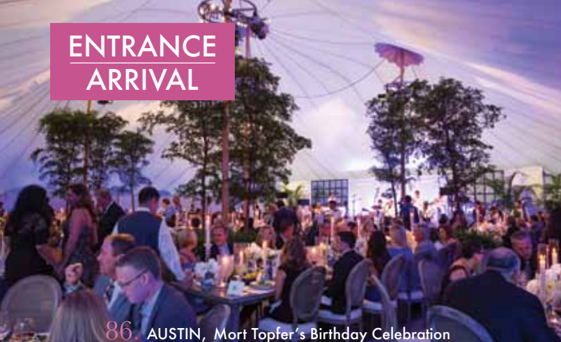
86. AUSTIN, Mort Topfer's Birthday Celebration