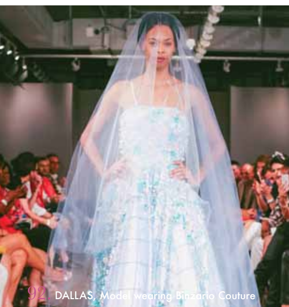
92. DALLAS, Model wearing Binzario Couture